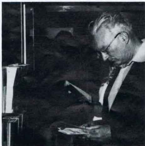
Centre: Plenty of interest in our leaflets.

Our informative display will be visiting a number of District offices during the winter, and has already been booked by North Mersey, Dee Valley and Clwyd.