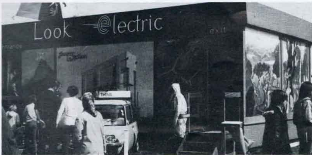
Right: The joint stand at Southport.