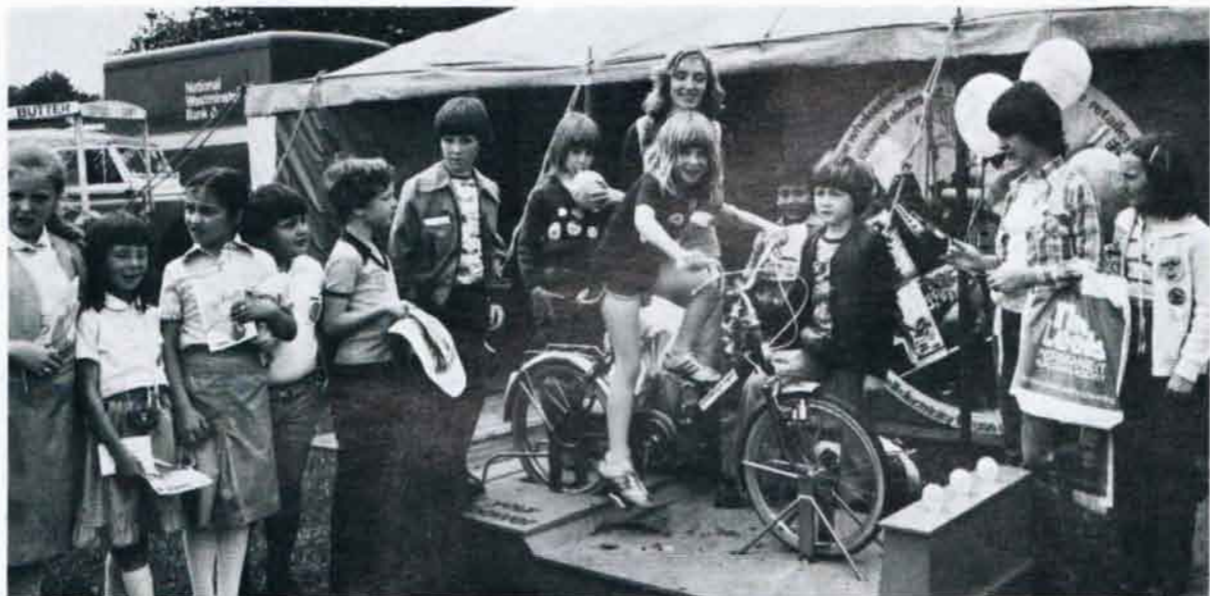
A popular attraction for the youngsters—a 'pedal power' generator (maximum output 300 watts!).