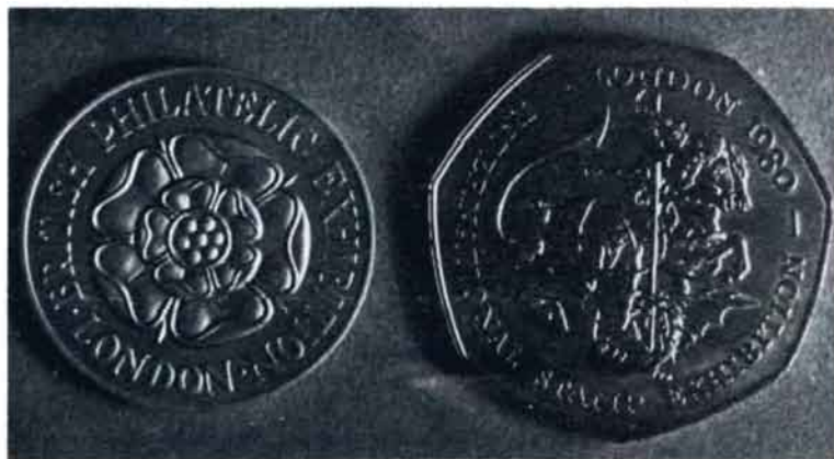
Left, the medals, and below, the first 'Pigeon Post' frank.

At 15 he travelled out to Singapore, where his father was serving, to join his parents. Alone aboard a troopship, he rubbed shoulders with officers of famous Indian regiments, such as the Bengal Lancers. This, and the two years he spent in Singapore, sowed the seeds of interest in the Orient and